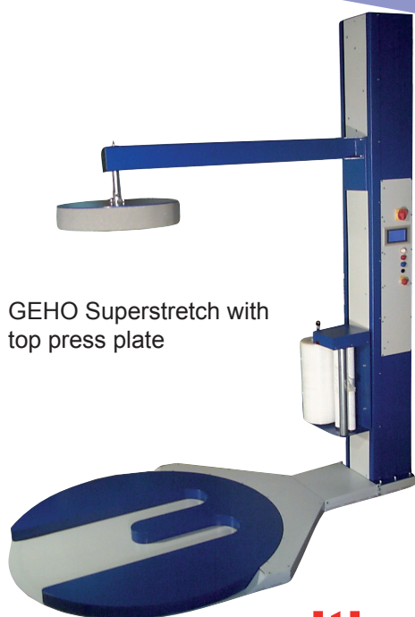
GEHO Superstretch with top press plate

with profiled turn- table, without ramp!